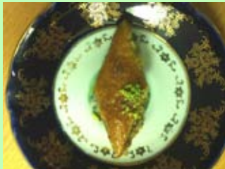
Afghan Walnut Backlava