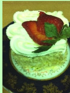
Afghan Style Fruit Cake